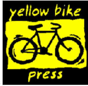
Yellow Bike Press